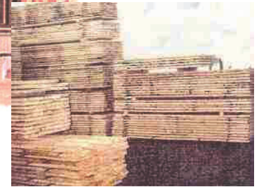
Plywood, studs, rafters, beams, trusses, decking, flooring all unfinished wood.