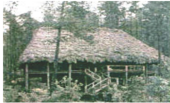
There is indoor and out door applications.

New construction, Remodels, Commercial, Residential, Industrial