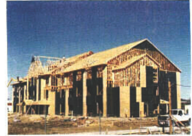
Framing lumber, floor, wall and roof sheathing plywood

A first class flame retardant for most applications. If you are like millions of people today who do not know today's technological advances. You might think nothing can be done to prevent whole house, apartment and building fire burn-outs. Not true! For the past 20+ years fire prevention and technology of fire retardant applications have made wood structures now fire safe and reduced smoke more than 70%. Universal Fire-Shield Fire Retardant Chemicals can and do protect like no other product known. It also prevents black mold and mildew.