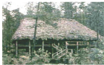
There is indoor and out door applications.

New construction, Remodels, Commercial, Residential, Industrial